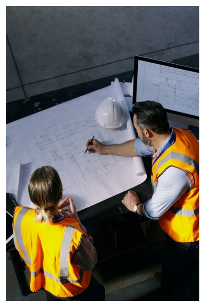
Sage Intacct Construction is purpose built for construction on the best-in-class Sage Intacct cloud platform.